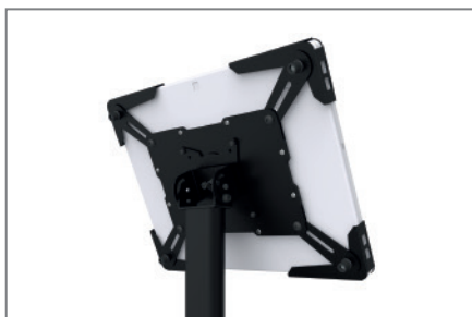
fully moveable and flexibly adjustable