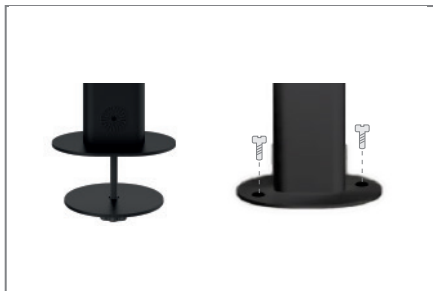
different installation options

The surface of the HA Flex-Lock Tabletstand is finished with an impact- and scratch-resistant powder coating in black, which makes the surface very carefree.